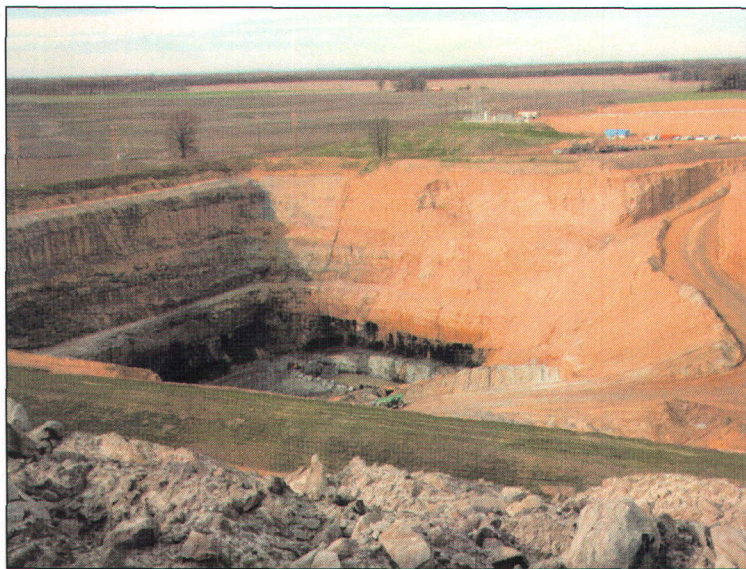
More than 3.1 million cubic yards of overburden was moved to make way for the Royal Eagle underground mine.

"We've moved 3.1 million cubic yards of overburden to make this hole," Sargeant said. "By comparison, they'll move 1.8 million cubic yards a month at Creek Paum."