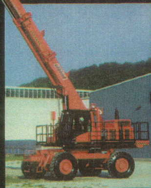
3250AD Scaler Remove loose material from roof, ribs and face 50' in any direction.

If your underground equipment could be doing more, Fletcher can help. Call Billy Goad today or visit www.jhfletcher.com