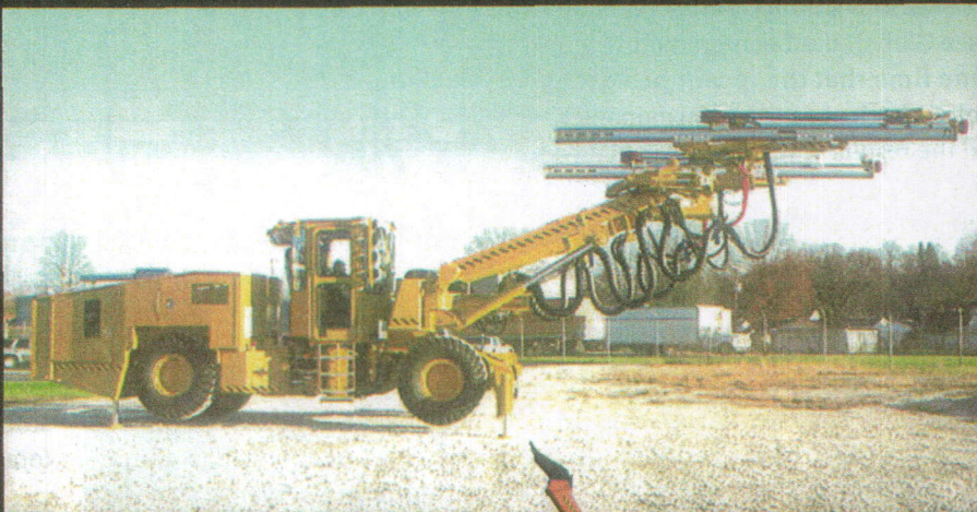
NEW! J-352-LS Dual Head Jumbo Allows you to cover headings up to 60' x 35' in one setting.

J.H. Fletcher & Co. P.O. Box 2187 Huntington, WV 25722-2187 Tel 304.525.7811 Fax 304.525.3770 E-mail: bgoad@jhfletcher.com