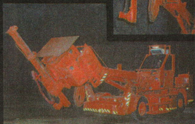
3125AD Man-Up Roof Bolter Articulated chassis. Drill from cab; bolt from basket.