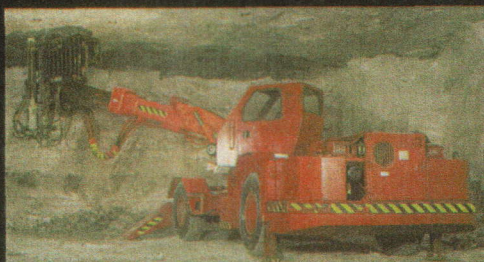
3025AD Remote Control Roof Bolter Tram and drill from the operator compartment.