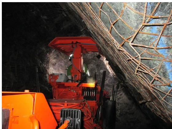
Fletcher N3114 AD/E