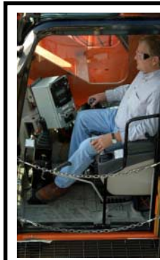
Certified Falling Object Protective (FOP) cab structure with rock guard. Cab features include 5 point operator safety harness, sound insulation, air conditioning, suspension seat and easy to use joystick controls.