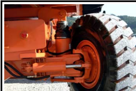
Totally enclosed wet disk brakes on each wheel and nitrogen charged strut suspension