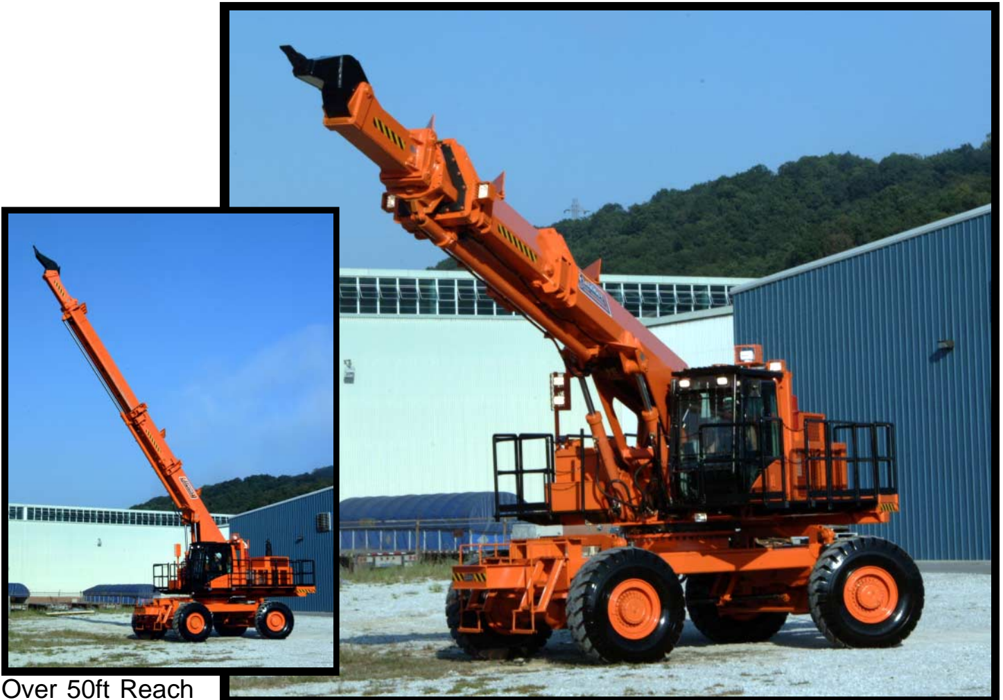
Over 50ft Reach

The Fletcher Model 3250RD Scaler with its extending boom is capable of reaching over 50'. With the Fletcher high reach scaler you get reliability, quality workmanship, longer machine life and support from experienced sales and service personnel.