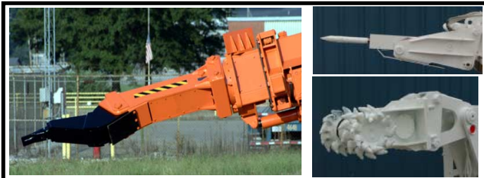
360° Tool rotation with pick or optional hydraulic breaker or cutter drum.