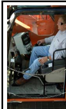
Certified Falling Object Protective (FOP) cab structure with rock guard. Cab features include 5 point operator safety harness, sound insulation, air conditioning, suspension seat and easy to use joystick controls.