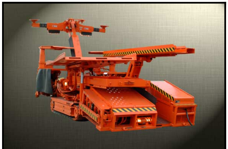
Shown with optional crawler drive and Materials Handling System

Mechanized mesh rack and mat rack as well as winch on material pods facilitate loading, storing, and operator access to the supplies. The mesh is delivered to the rear of the machine where the bolter operator winches the shifts supply of mesh into place using the radio control. The material pods are vendor loaded above ground and delivered to the rear of the machine. The operator uses the radio control to winch that days supply of consumable materials on to the bolter. The empty pods are off loaded and returned to the outside to be reloaded.