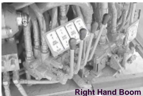
Right Hand Boom Gresen Valve

This change can be made to existing RR-II machines in the field. If you would like additional information please contact your local Fletcher sales or service representative or our Service Department (304) 525-7811