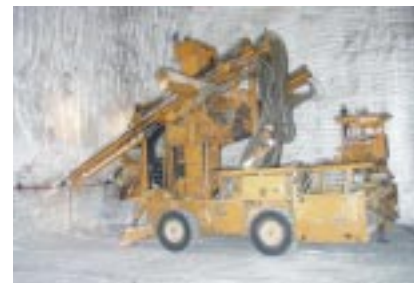
Face Drill with Mast Carriage Mounted Booms