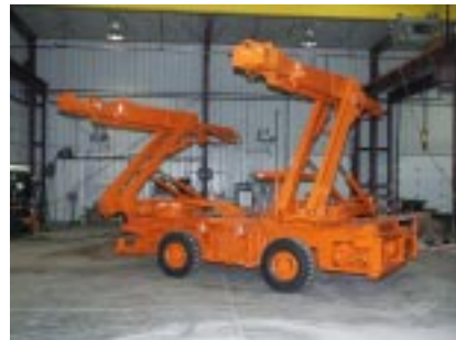
Face Drill with Lifting & Traversing Booms