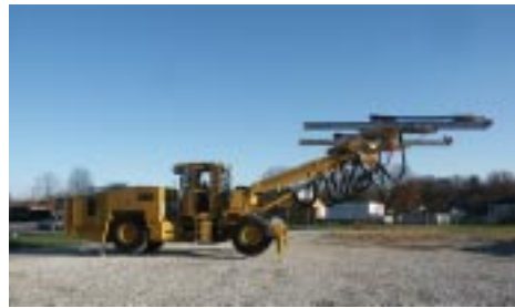
Dual Boom Jumbo