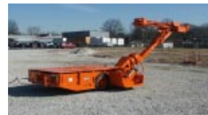
Single Boom Low Profile

In January 2004, J. H. Fletcher & Co. announced the purchase of equipment designs, drawings and goodwill from WDM technologies, LLC of Claremont, NH. This move extended the line of Fletcher industrial minerals (IM) division mining equipment to include single and dual boom face and bench jumbos and hydraulic rotary impact drills. Nearly a year later, the line is making a positive impact on the limestone industry with 7 Jumbos currently operating underground.