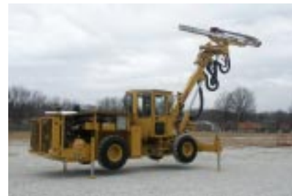
Single Boom Jumbo