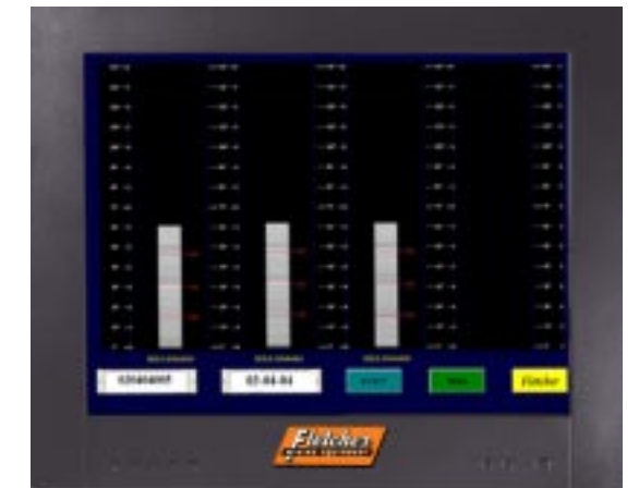
In Cab Display

For the Fletcher Electronic Feedback System with roof mapping capabilities, the real time display is a valuable option. The display can be mounted in the cab of the roof bolter and is hardwired into the Drill Control Unit (DCU). The display is an environmentally sealed, rugged touch screen. The system automatically records and analyzes sensor data from each drilled hole, then void or separation locations and relative material hardness are displayed on the screen. The screen also displays the current date, time and hole number. The operator has the ability to scroll through and display archived data. The built in hard drive can store large quantities of data which can be downloaded onto any USB memory device and taken to another computer for analysis. In addition, the unit can be used to display parts books, service manuals and operator's manuals. Also available early in 2005 is a small plug in module called a Pendant Recorder. The recorder will plug into the 4 pin connector located on the face of the DCU-142 (Drill Control Unit). The unit displays the file name during drilling for the operator to note. The information can then be downloaded to a PC for analysis.