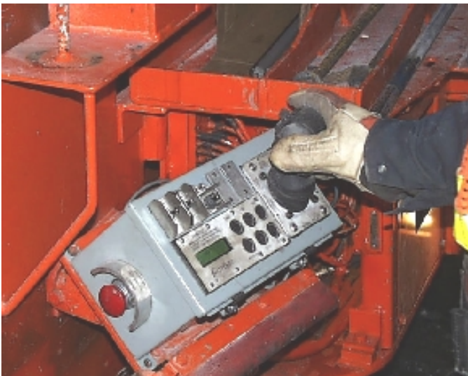
Fletcher Auto Drill - Feed Back Control

The auto-drill feed back system utilizes a microprocessor with programmable subroutines that monitors feed rate, feed thrust, rotation, torque and vacuum. This system also records drilling data that can be utilized in mapping the roof strata. As part of the educational program of MINExpo 2000, a special paper, "Practical Application of Microprocessor Controlled Feedback Roof Bolting" will be presented by West Virginia University and Blue Mountain Energy Co. on October 11 (Wednesday) at 8:15 am.