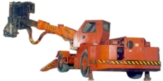
ARR-D Roof Drill