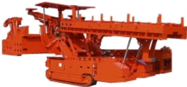
Quad Ranger with Material Handling System

The Quad Ranger roof drill that will be on display has been going through field testing the last several months. This walk way type bolter with 4 drill heads has proven to be a flexible and reliable machine. By using proven and reliable components (drilling system, dust system, crawlers and electrics) with a material handling system and our auto-drill feed back control system (patent pending), we have developed the most advanced roof control drill in the world.