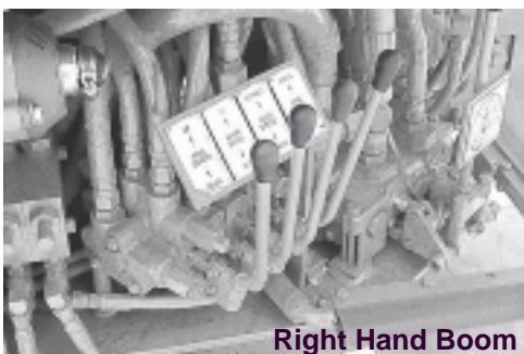
Right Hand Boom Gresen Valve

This change can be made to existing RR-II machines in the field. If you would like additional information please contact your local Fletcher sales or service representative or our Service Department (304) 525-7811