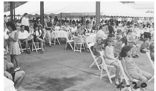
Employees and their families enjoy the entertainment

Sixty years of success would not have been possible without our customers. We thank you for your continued support.