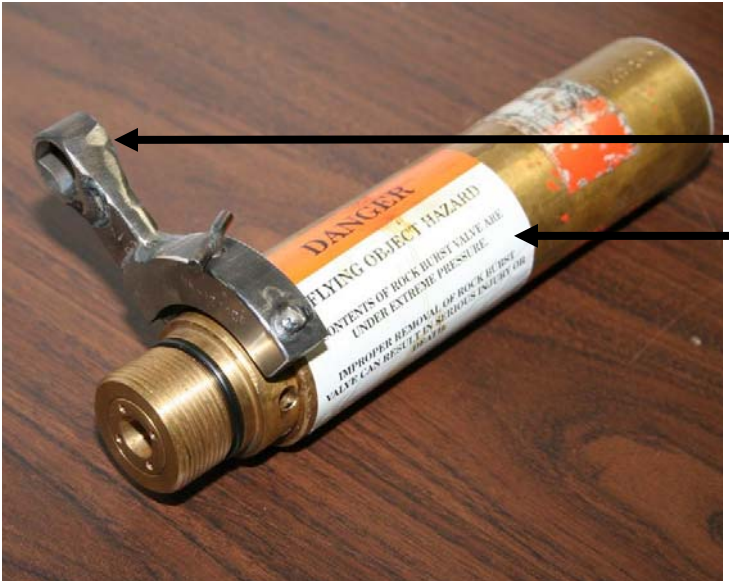
WRENCH ON ROCK BURST VALVE