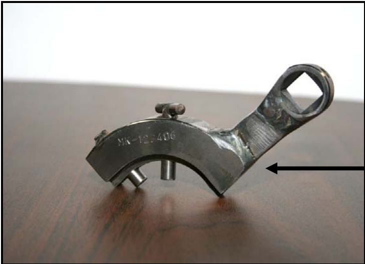
ROCK BURST VALVE WRENCH