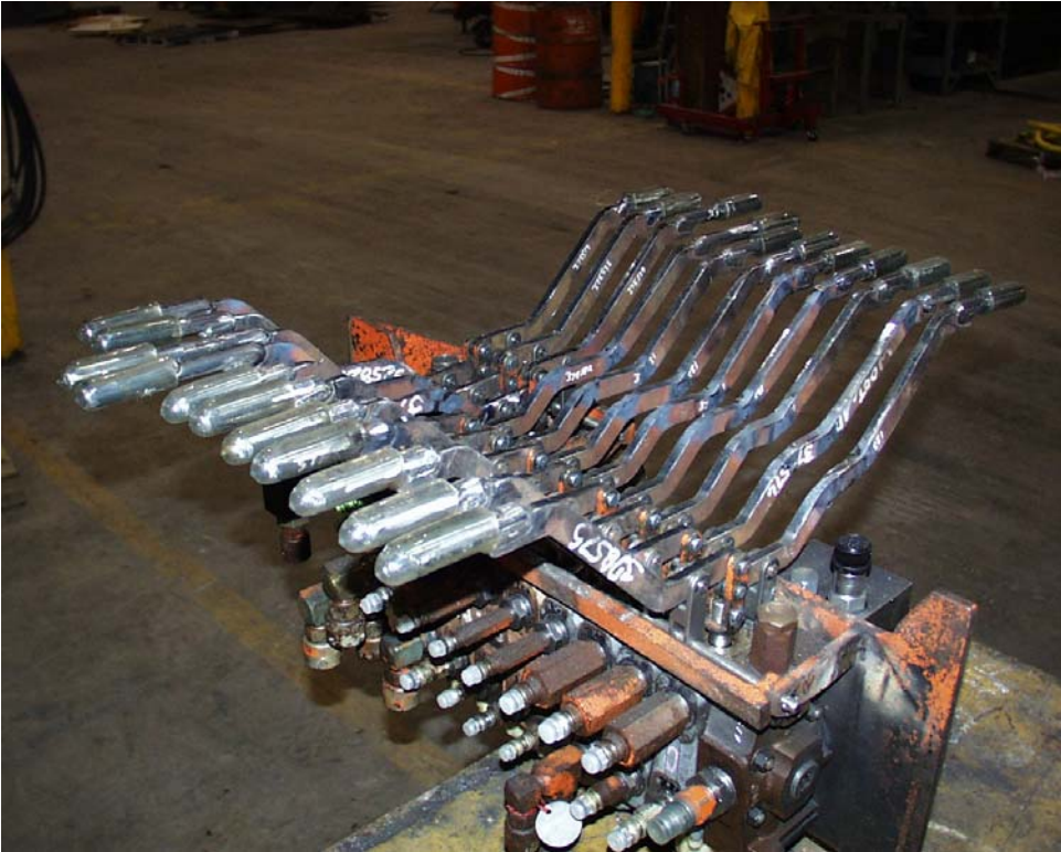
PHOTO 1 CORRECT BEND AND LENGTH OF DR CONTROL LEVERS

Information Bulletin No. 96 Subject: Control Levers Date: March 2004