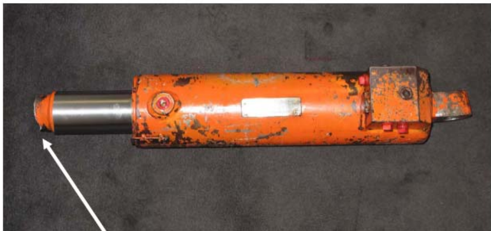
CYLINDER SEPARATED FROM EYE